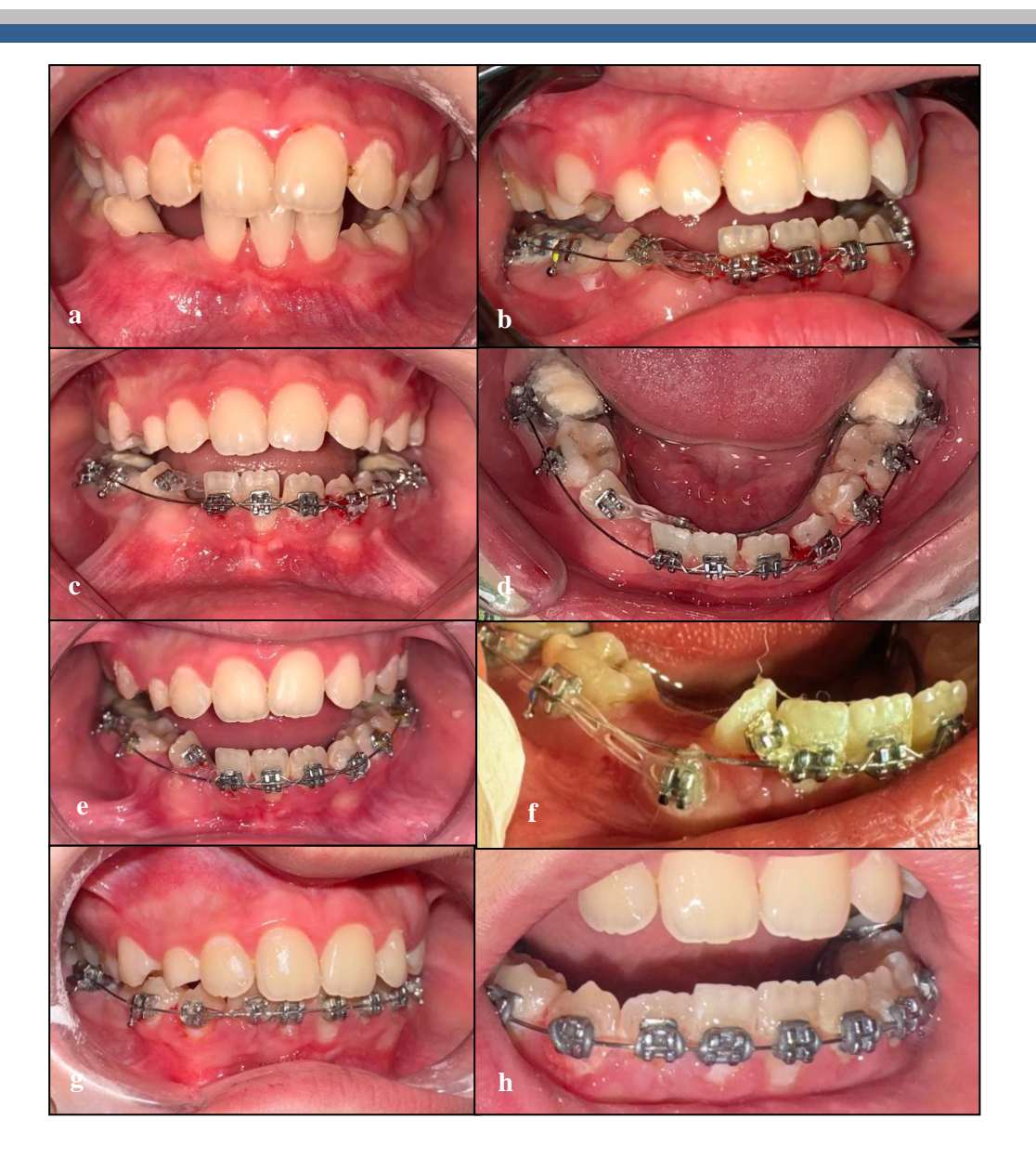
Figure 3. Fixed orthodontic treatment process: (a) preoperative intraoral image; (b) the attachment of #42 to the bracket on #41 was achieved using an elastic chain; (c-d) The attachment of #42 to the lingual button on #41 was achieved using an elastic chain and the bracket was bonded to tooth #43 for distalization; (e-f) in the later stages of treatment, #42 was once again connected to the bracket on #41 using an elastic chain; (g-h) the archwire was threaded through the bracket on #42.