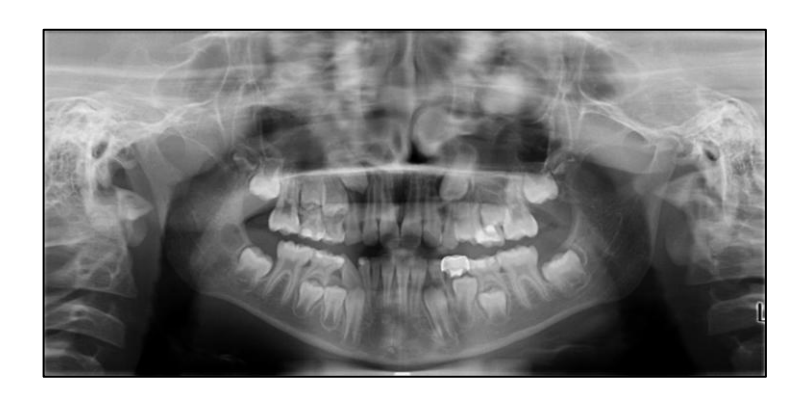
Figure 2. Initial panoramic radiograph.

Two months after the extraction of the primary teeth, a follow-up examination revealed a decision to proceed with fixed orthodontic treatment to correct the positioning of the teeth (Figure 3a). At the start of the orthodontic treatment, tooth #42 was connected to tooth #41 with an elastic chain, and teeth #41, #31, and #32 were secured together with a wire ligature, with a 0.12 Ni-Ti wire applied (Figure 3b). In the subsequent appointment, an elastic chain was attached from tooth #42 to a button