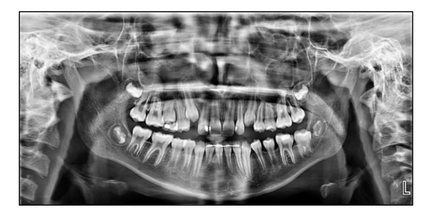
Figure 5. The patient's final radiograph.