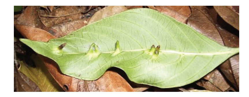
Figure 1. The leaf of Psychotria barbiflora (Rubiaceae) galled by midges (Diptera: Cecidomyiidae) in north-eastern Brazil. Bar = 1 cm.

insect distribution, ten transects of 50 m were conducted in the field. Along each transect, all individuals of the P. barbiflora species were examined for height (cm), total leaf bore and number of galled leaves. For each galled leaf, a position index was established to determine whether the galls were formed on apical leaves or on basal leaves. Differences in galled position on plant leaf were tested using Kruskal-Wallis test.