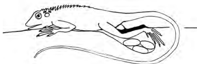
FIG. 3. Egg laying of C. calotes (Linnaeus, 1758). Postura de huevos de C. calotes (Linnaeus, 1758).

hind limbs, in a way similar to C. versicolor , C. liocephalus and C. ceylonensis (Amarasinghe & Karunarathna 2007 and 2008; Pradeep & Amarasinghe 2009), but C. liolepis throws the soil backwards alongside its body (Karunarathna et al. 2009). C. liolepis dug the hole straight inward to the ground (Karunarathna et al. 2009) while C. versicolor , C. ceylonensis and C. liocephalus (Amarasinghe & Karunarathna 2007 and 2008; Pradeep & Amarasinghe 2009) dug the hole into the ground at a 45° angle. However, C. calotes dug the hole into the ground at a 35° angle.