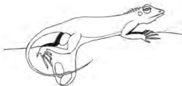
FIG. 4. Egg laying of C. ceylonensis Müller, 1887. Postura de huevos de C. ceylonensis Müller, 1887.

hind limbs, in a way similar to C. versicolor , C. liocephalus and C. ceylonensis (Amarasinghe & Karunarathna 2007 and 2008; Pradeep & Amarasinghe 2009), but C. liolepis throws the soil backwards alongside its body (Karunarathna et al. 2009). C. liolepis dug the hole straight inward to the ground (Karunarathna et al. 2009) while C. versicolor , C. ceylonensis and C. liocephalus (Amarasinghe & Karunarathna 2007 and 2008; Pradeep & Amarasinghe 2009) dug the hole into the ground at a 45° angle. However, C. calotes dug the hole into the ground at a 35° angle.