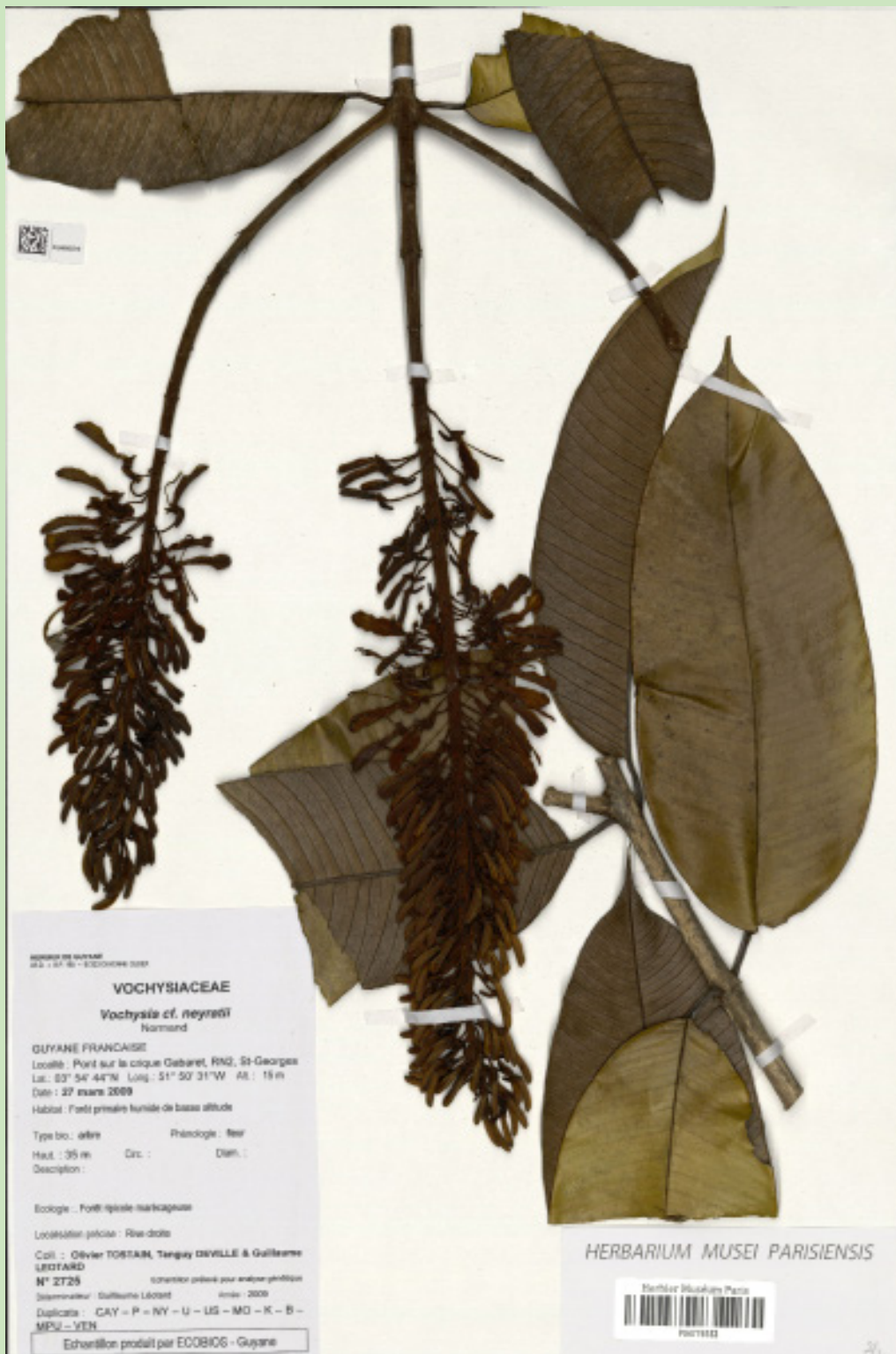
[FIGURE 2] Photo of holotype (P) of Vochysia sofiae downloaded from https://science.mnhn.fr/institution/mnhn/collection/p/item/p04776153?listIndex=295&listCount=1927 .