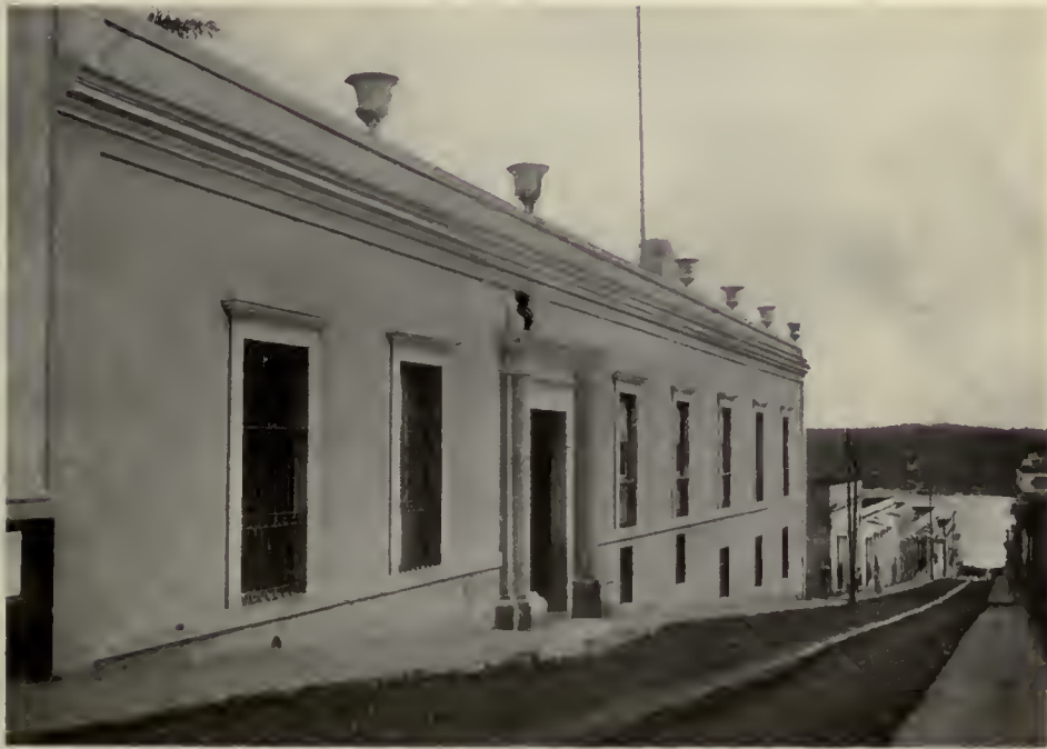
THE BUILDING WHERE THE CONGRESS OF ANGOSTURA HELD ITS MEETINGS