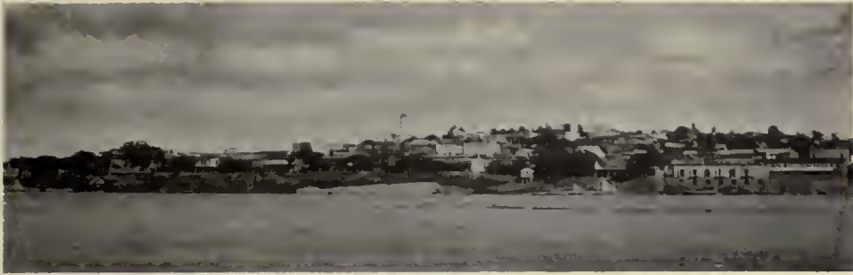
A PANORAMIC VIEW OF ANGOSTURA, NOW CIUDAD BOLIVAR