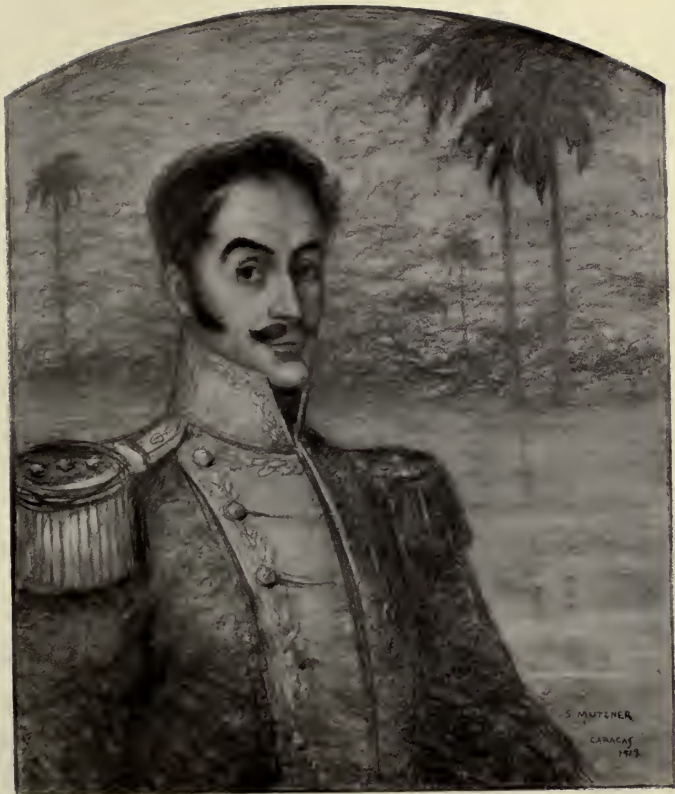
BOLÍVAR IN 1819 BY THE RUMANIAN PAINTER, SAMYS MÜTZNER